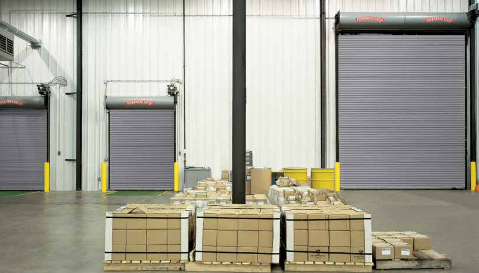
Gray finish. Installation and service: Overhead Door Company of Huntsville